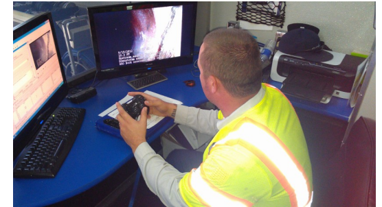
Inspecting sewer using remote controlled camera